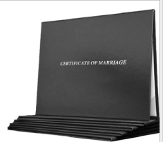
Kitenna Certificate tuamna