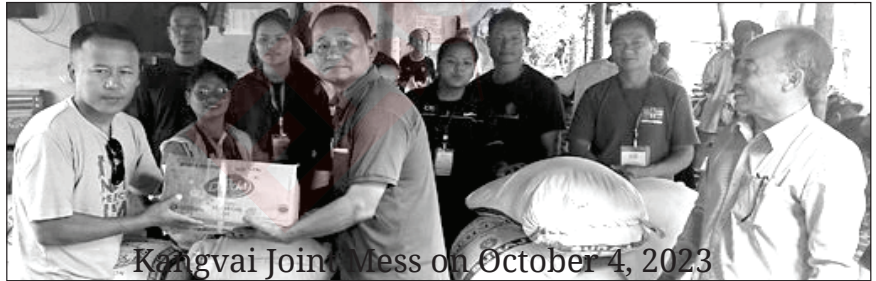
Kangvai Joint Mess on October 4, 2023

Relief Thohlawm leng mimal khenkhat leh tualsung Saptuam bangzah hiam apan honglut panpan ta a, honglut zomzel lai dia lamet ahi. Toupa'n Saptuamte hon ompih chiat hen aw.